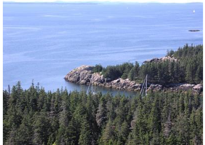
View of the harbor from the Duck Harbor Mountain trail

this trail to be the most beautiful of all.