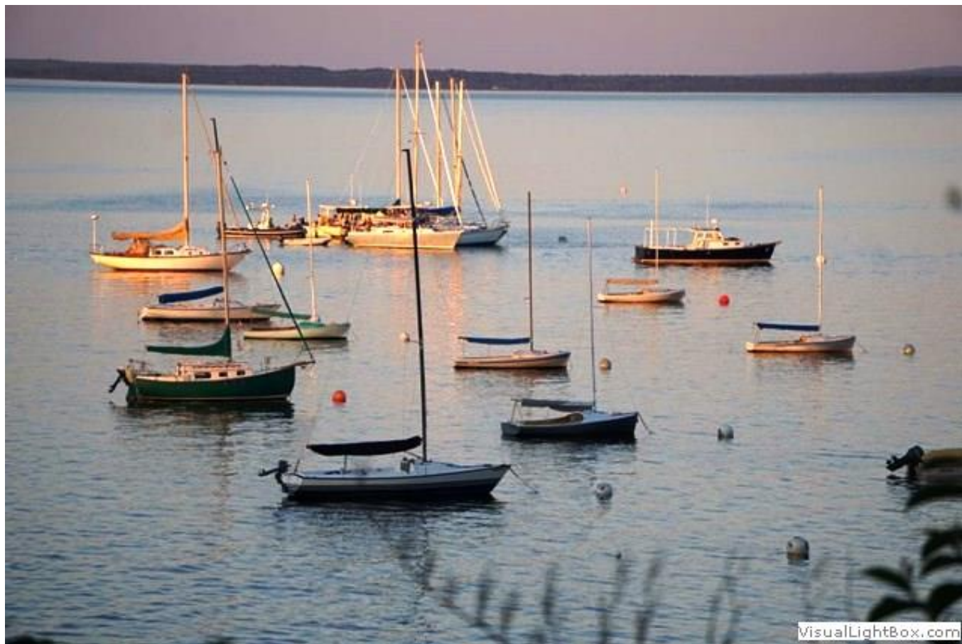
Friday night raft-up in the harbor, July 2016