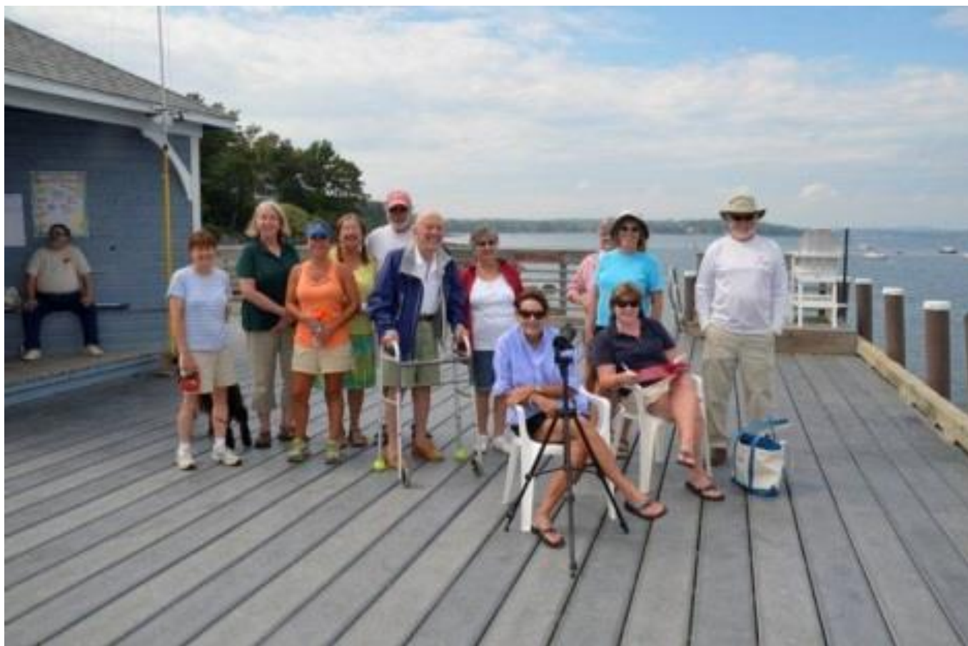
Dock crew, 2014 Around Islesboro Race